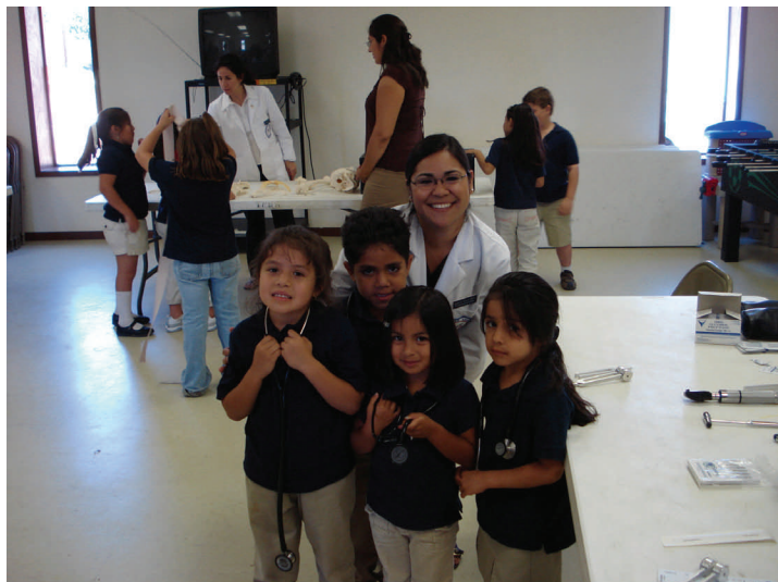
FUTURE PAs OF AMERICA